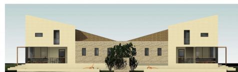
Jug 1 : 100

The distance from the city center and well-kept beaches is 3000m