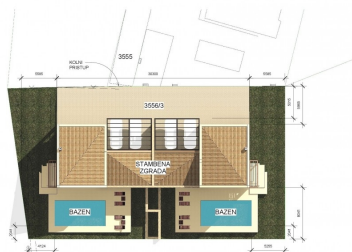
Situacija 1 : 200