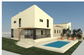
Pogled iz dvorišta