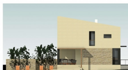
Islok 1 : 100