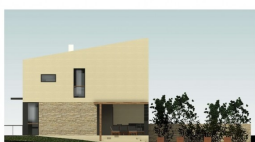
Zapad 1 : 100